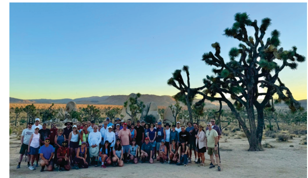
2024 9th Annual ACFAP Meeting Palm Springs, CA

This activity has been planned and implemented in accordance with the standards and requirements for approval of providers of continuing education in podiatric medicine through a joint provider agreement between the William L. Goldfarb Foundation as a provider of continuing education in podiatric medicine. The William L. Goldfarb Foundation will be seeking approval this activity for a maximum of 11 continuing education contact hours.