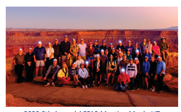
2023 8th Annual ACFAP Meeting Moab, UT

This activity has been planned and implemented in accordance with the standards and requirements for approval of providers of continuing education in podiatric medicine through a joint provider agreement between the William L. Goldfarb Foundation as a provider of continuing education in podiatric medicine. The William L. Goldfarb Foundation will be seeking approval this activity for a maximum of 11 continuing education contact hours.