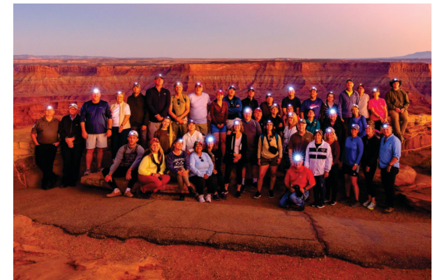
2023 8th Annual ACFAP Meeting Moab, UT

This activity has been planned and implemented in accordance with the standards and requirements for approval of providers of continuing education in podiatric medicine through a joint provider agreement between the William L. Goldfarb Foundation as a provider of continuing education in podiatric medicine. The William L. Goldfarb Foundation will be seeking approval this activity for a maximum of 13.5 continuing education contact hours.