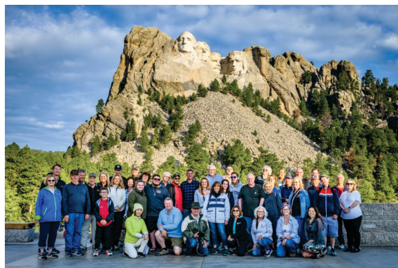
2022 7th Annual ACFAP Meeting Mount Rushmore, SD

In the event of cancellation ACFAP is unable to assume risk or responsibility for the exhibitor's and/or registrants time or expenses should an act of God, government action, disaster, weather or other force beyond ACFAP's control make it inadvisable or impossible to conduct this event. The exhibitor and/or registrant may wish to consider purchasing personal travel insurance to insure their expenses.